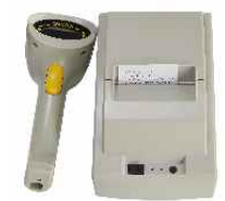
Optional scanner & printer