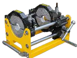
Model WP160C2 2 rings frame