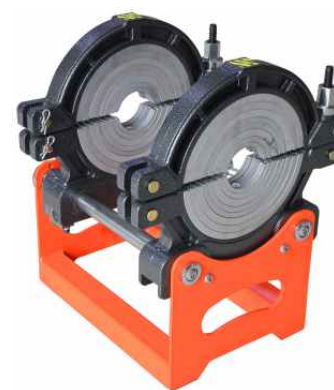
Model D2 series