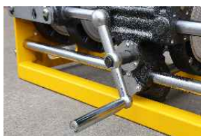
Unique gear transmission design Steady & smooth operation