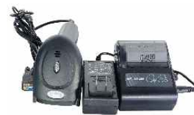
Optional scanner & printer