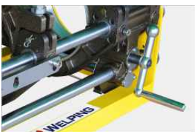
Unique gear transmission design Steady & smooth operation