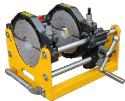
Model WP200C2 2 rings frame