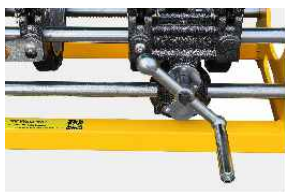
Unique gear transmission design Steady & smooth operation